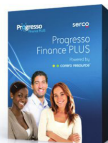
Serco Learning (stand D180)

Serco will also launch Progresso Finance PLUS, a new module for its Progresso Management Information System, for controlling costs and improving cash flow.